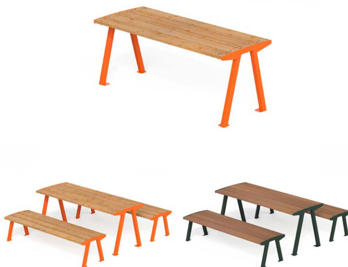
NOALE TA W